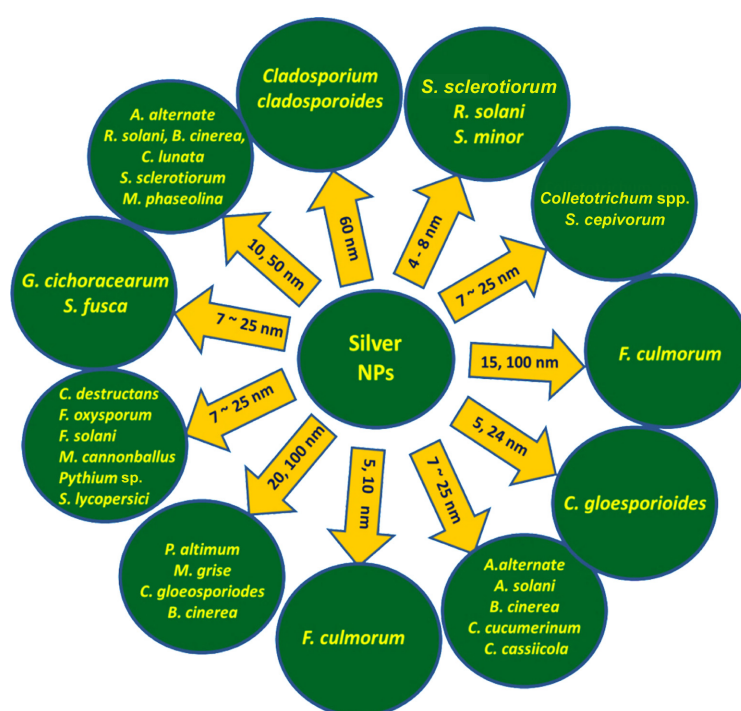
Fig. 3. Illustration of some fungal pathogens that are suppressed by silver, with influential sizes of nanoparticles (NPs).

Silver NPs have been used against different fungal plant pathogens and their suppressive effects on growth and structures of fungi have been reported in Alternaria alternata , Rhizoctonia solani , Botrytis cinerea , Curvularia lunata , Sclerotinia sclerotiorum , Macrophomina phaseolina [35], Cladosporium cladosporioides [75]; Alternaria alternate ; Alternaria brassicicola ; Alternaria solani ; Botrytis cinerea ; Cladosporium cucumerinum ; Corynespora cassicola ; Cylindrocarpum destructans ; Didymella bryoniae ; Fusarium oxysporum f. sp. cucumerinum ; F. oxysporum f. sp. lycopersici ; F. oxysporum ; Fusarium solani ; Fusarium sp; Glomerella cingulate ; Monosporascus cannonballus ; Pythium aphanidermatum ; Pythium spinosum ; Stemphylium lycopersici [37]. Golovinomyces cichoracearum , Sphaerotheca fusca [38]; Colletotrichum spp. also; Sclerotium cepivorum [76];